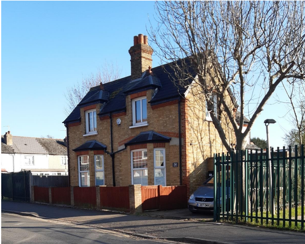
56 Manor Lane as it stands in 2023