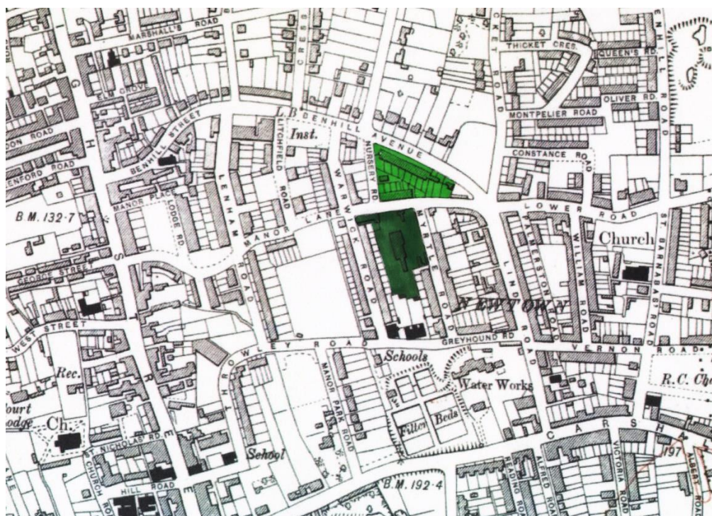
Map showing the locations of the old (light green) and new (dark green) nurseries (Based on the OS six-inch map of 1914)