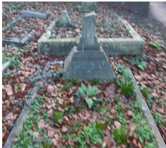
The grave of John Ruck in St Nicholas churchyard.