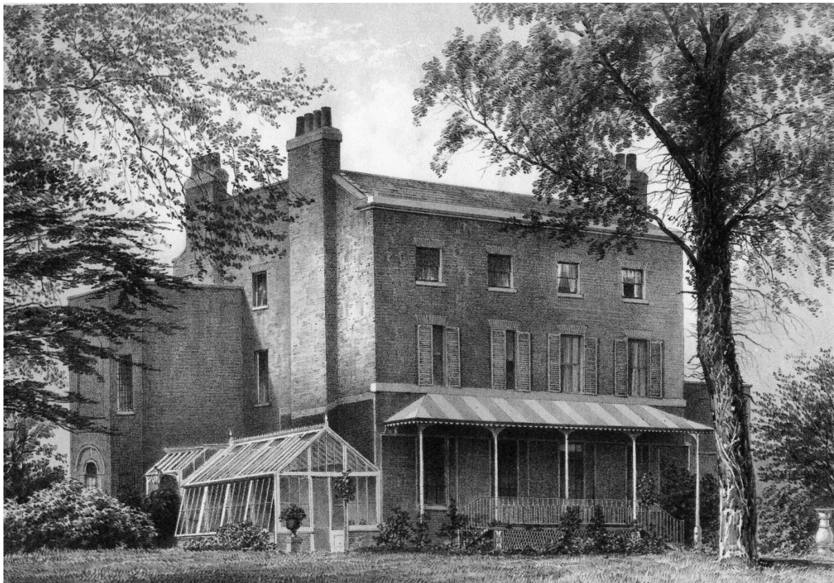
Engraving of The Limes in the 1866 Culvers Estate sales catalogue.

The Reynolds' family built The Limes about 1786. An early form of the un-named house is shown on the Reynolds Estate Plan of 1808 as parcel 33.